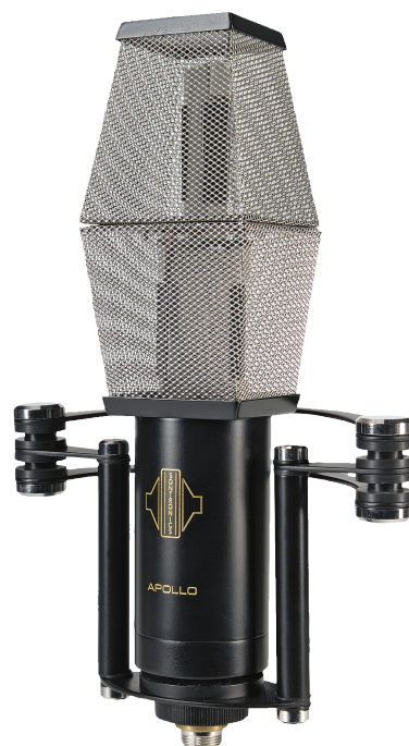
Frequency Chart: Apollo

The APOLLO is available in a Black Satin finish with gold lettering. It is packaged in an aluminum carrying case with special shockmount.