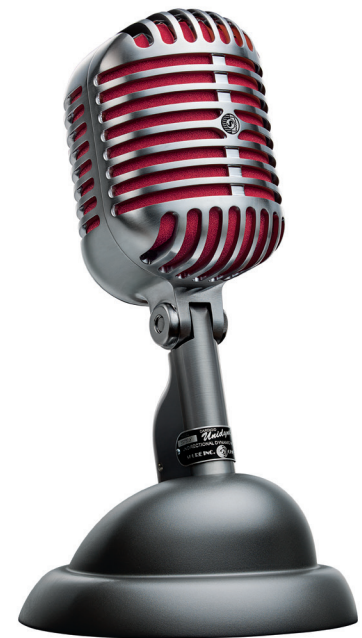
5575LE Unidyne® Limited Edition 75 th Anniversary Model