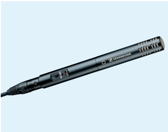
Pictured with K6 powering module and cable (available separately)

The ME 64 is a cardioid microphone head designed for use with the K6 and K6P powering modules. It has a very wide range of applications including reporting, interviews, dubbing, live sound reinforcement and recording applications. Matt black, anodised, scratch-resistant finish.