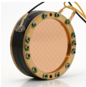
Edge Terminated Dual Backplate