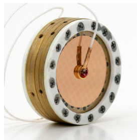
Center Terminated Dual Backplates Holes in Square Grid