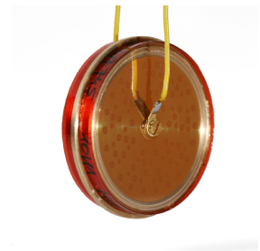
Center Terminated Single Backplate Glued Diaphragms