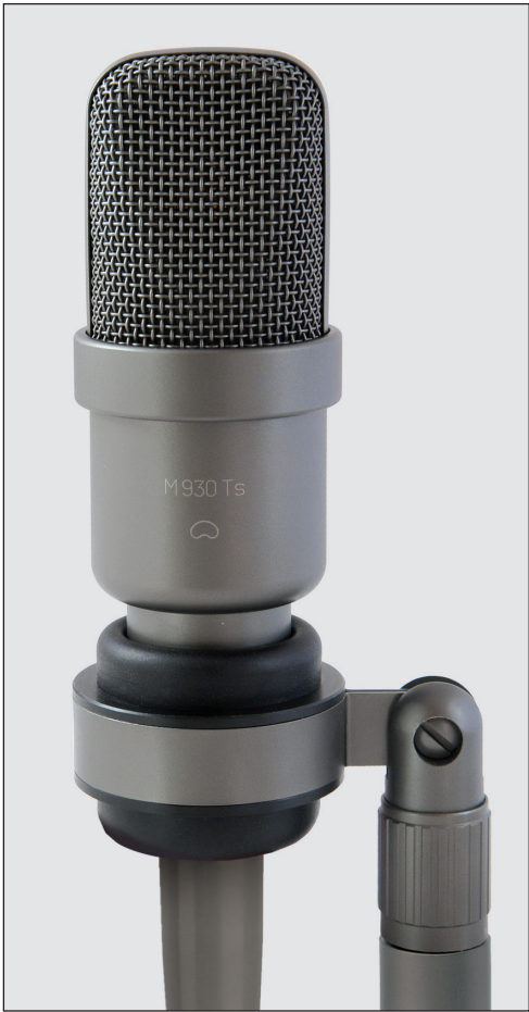
pick-up pattern M 930 Ts with EH 93, dark bronze

The pick-up pattern is perpendicular to the direction of the microphone axis (side addressed) and is marked by the model number and the polar pattern symbol. The company logo is at the reverse side of the microphone. A condenser microphone capsule with a diameter of 28 mm and a gold-plated polyester membrane is installed as sound transducer. The polar pattern is cardioid with a very high attenuation of rear sound incidence. The M 930 Ts has a constant frequency response with an accentuation of approximately 2,5 dB between 6 kHz and 12 kHz to raise the speech and high-frequency presence. The change of the low end frequency response caused by the proximity effect is well-balanced without a very strong overemphasis at small microphone distances.