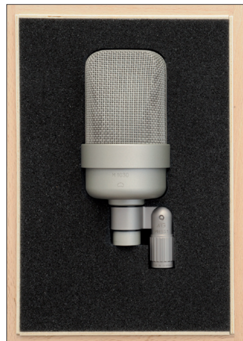
M 1030 satin matt