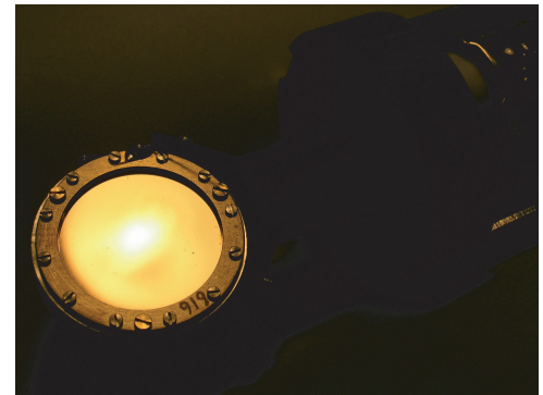
The unique ck12 capsule

Bock 151 0, 90, 180 deg sens = 20mV/Pa distance = 1 meter