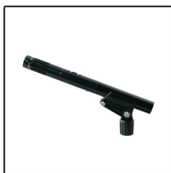
UEM81C on MC81