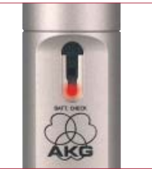
Battery status LED: Battery ok – LED blinks briefly

The red LED above the microphone switch stays illuminated when the remaining battery life falls below 45 minutes. When the mic is turned on, the LED blinks briefly to indicate that a usable battery is correctly inserted. The LED does not function when phantom power is used.